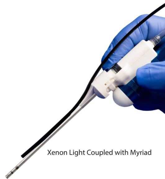
Xenon Light Coupled with Myriad

The NICO Myriad NOVUS includes the capital components of a console, Myriad-LX® Light Source, foot pedal and console cart, and the single use products of the Myriad handpiece and Myriad-LX Illumination Sleeves/Fiber.